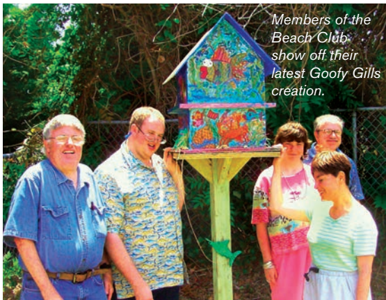
Members of the Beach Club show off their latest Goofy Gills creation.

The Goofy Gills name and designs are copyright protected. © 2011 by Wendi Willoughby. All rights reserved.