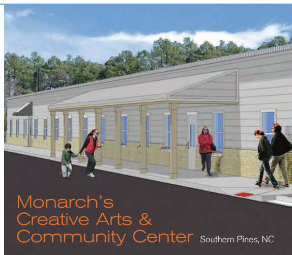
Monarch's Creative Arts & Community Center Southern Pines, NC

Professional artists, local community college interns and faculty, and community volunteers will work alongside Monarch staff to teach people each day.